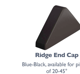
Blue-Black, available for pitches