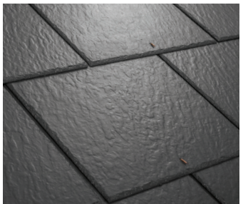
300 x 600mm Finely detailed surface, dressed edges Replicates natural slate